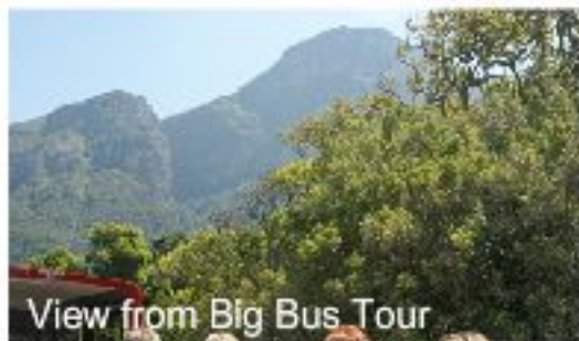
View from Big Bus Tour