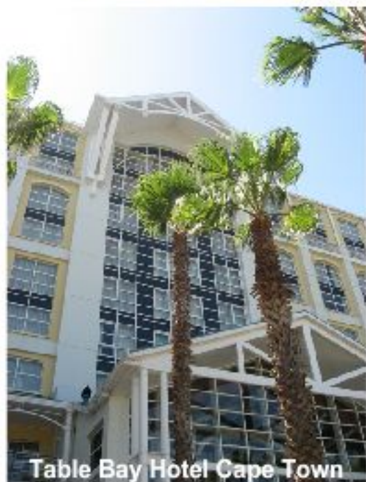
Table Bay Hotel Cape Town