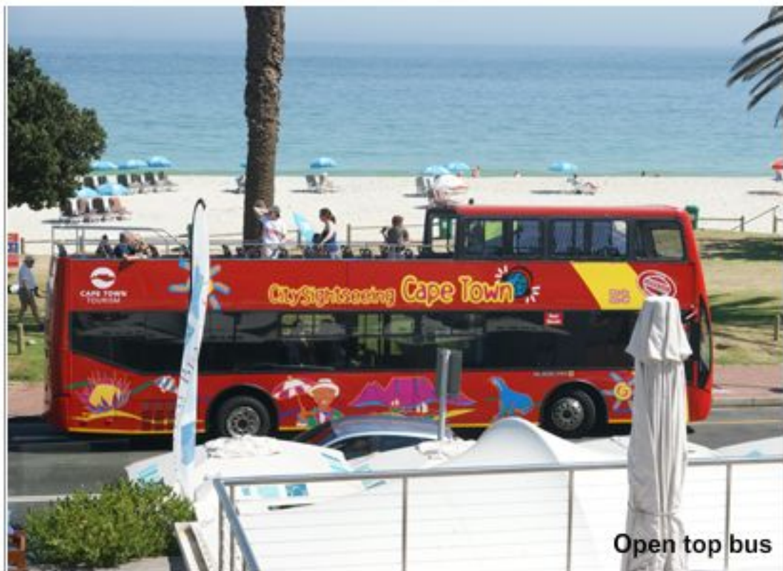
Open top bus

On the Waterfront vibrant attractions include boat tours, museums, shops, cafes and restaurants, and a lively night life. Jazz bands and individual performers entertain the crowds. Prominent is the Two Oceans Aquarium; vast tanks allow close views of diverse fish from both the Atlantic and Indian Oceans. Allow at least 2-3 hours. Popular with families there is a café where I watched basking seals enjoying the summer sunshine. Waterfront Boats offer a wide range of trips from short trips round the bay to whole day sailings. I took the "Sunset Cruise" in a fully rigged sailing ship. With a glass of champagne I saw the sunset on the harbour and although out of season had close encounters with several whales and returned with good views of the lit up waterfront.