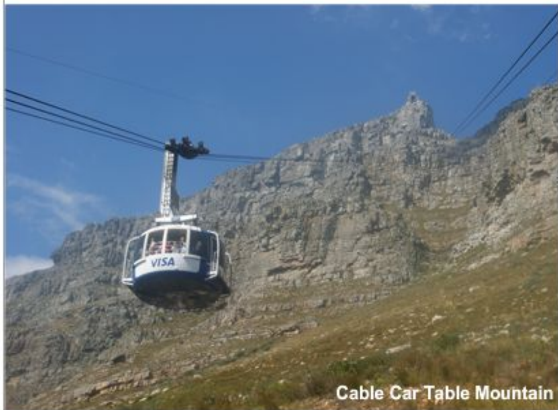
Cable Car Table Mountain

Whilst the city centre has a longer history, the V&A Waterfront has become the better known, with many hotels spreading from the water line up the slope of the scenic drop-back of Table Mountain. I stayed a few days at the 5 star Table Bay Hotel. A luxury hotel in a prominent commanding position with immediate access to the Waterfront. Rooms are spacious and well equipped with large bathrooms and many splendid views of the mountains and harbour. From my balcony there was a picture postcard view of the waterfront and Table Mountain. There is a good selection of restaurants and an airy relaxed atmosphere. The breakfast buffet seems to stretch to infinity with items to tempt all palates.