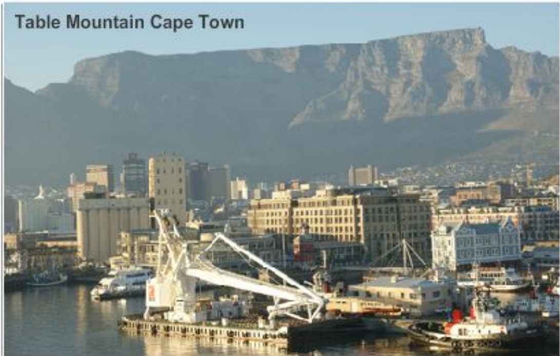
Table Mountain Cape Town

In 1480 the Cape attracted Portuguese navigator Bartolomeu Dias Who became the first European to land in South Africa. Ten years later Vasco da Gama also sailed round the Cape but continued on to India founding the Spice Route. A stone replica of his original cross stands tall on the hillside. A half day excursion to the Peninsula is possible if time is limited. Elle Tours can arrange this and any other requirements such as city tours, wine tours, Robben Island, etc.and transfers if required. I used this small tour operator throughout and was impressed with the personal service given by the owner, Gavin. I indulged in the full day private car which allows individual wishes to be met. I included the spectacularly situated huge Rhodes Memorial (not available on set tours) and continued on to the Peninsula visiting the Kirstenbosch Gardens, the Naval base of Simons Town and the attractive fishing port of Houts Bay where there are local boats to see the