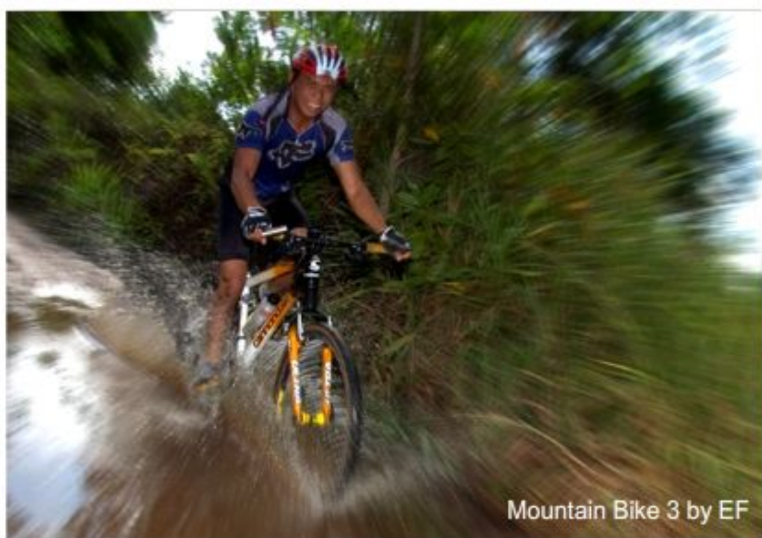
Mountain Bike 3 by EF