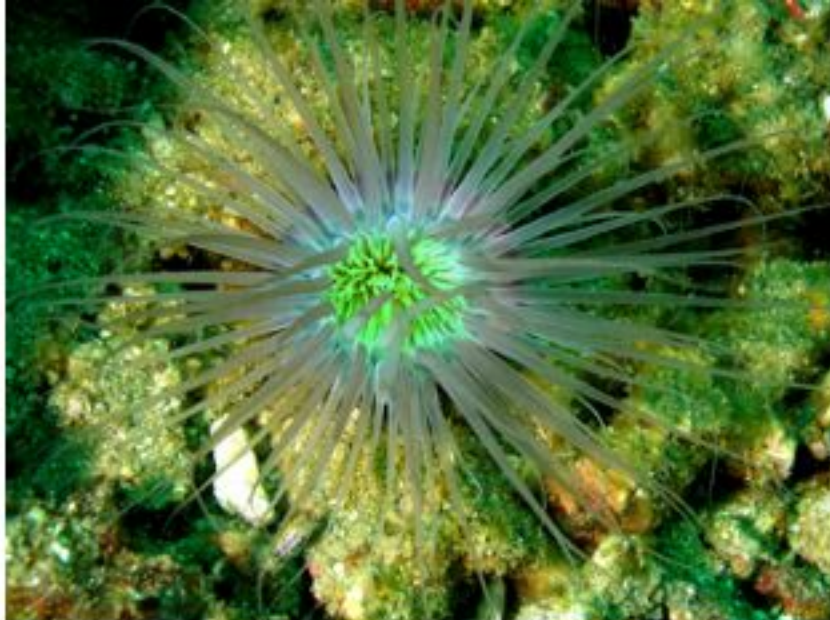
Purple tube anemone

80kph along 810 metres of track, delivering five inversions around tight corkscrew curls at the rate of 5-Gs! Other rides that will take your breath away include the 48-metre 4-G Giant Drop, the exhilarating (and wet!) rush of the reverse-drop Log Flume, and the Top Spin, featuring a two-tiered platform that flips in two different directions suspending the rider upside down, among over 30 other heart-stopping rides.