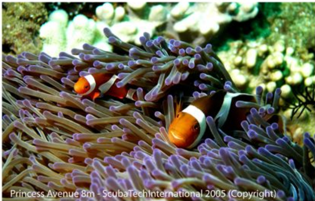
Princess Avenue 8m

Tour the park in style in miniature buggies that resemble some of the luxury cars owned by His Majesty the Sultan, enjoy the views from the Sky Tower as it gently rotates and rises 78 metres to reveal a magnificent 360 degree panorama of the capital, or take a virtual reality ride in one of the custom built simulators specially designed for Jerudong Park! Or, for a rush of adrenalin, step on board the “Pusing Lagi,” a custom-built suspended roller coaster that travels at a maximum speed of