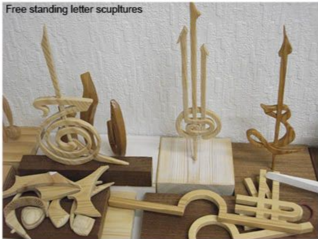
Free standing letter sculptures

Hassan Al-Jarrah's work introduces the third dimension to Arabic calligraphy. He is a master of calligraphy on wood – free standing pine wood cuts which resemble sculptures and exquisitely carved Quranic verses mounted on a velvet background with a wooden frame.