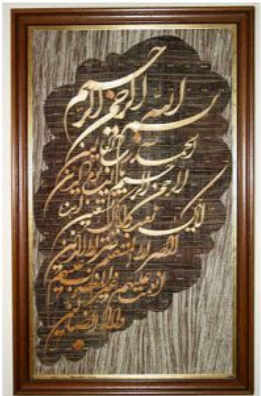
The Opening Passage of the Quran