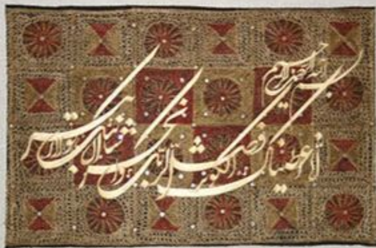
The shortest passage in the Quran