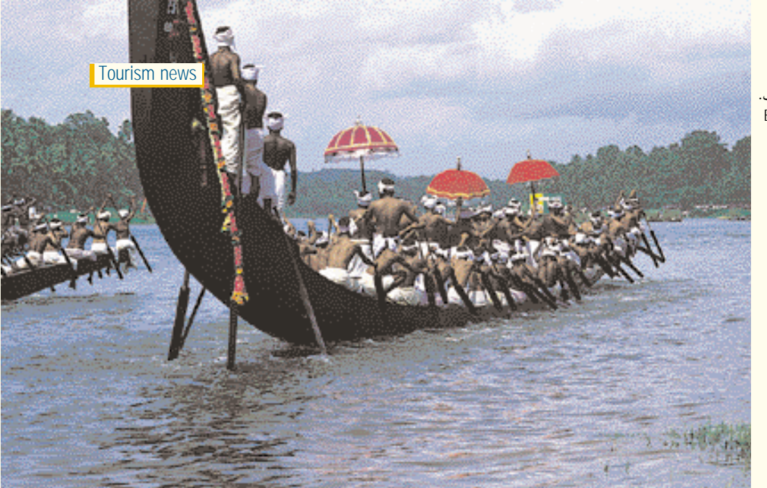
سباق القوارب. Boat Race.

Srinagar, the capital of Jammu and Kashmir, was often referred to as "paradise on earth" by the early Mughals, who journeyed to the cooler mountains of Kashmir in summer and developed Srinagar's famous waterfront Mughal Gardens. The Mughals also patronized art and culture among the people of Kashmir - a rich heritage that thrives today in the plethora of artisanship and making of handicraft, prized as gifts, worldwide. Kashmir is a land where many holiday dreams are realized; spectacular landscapes, distinctive seasons, skiing and