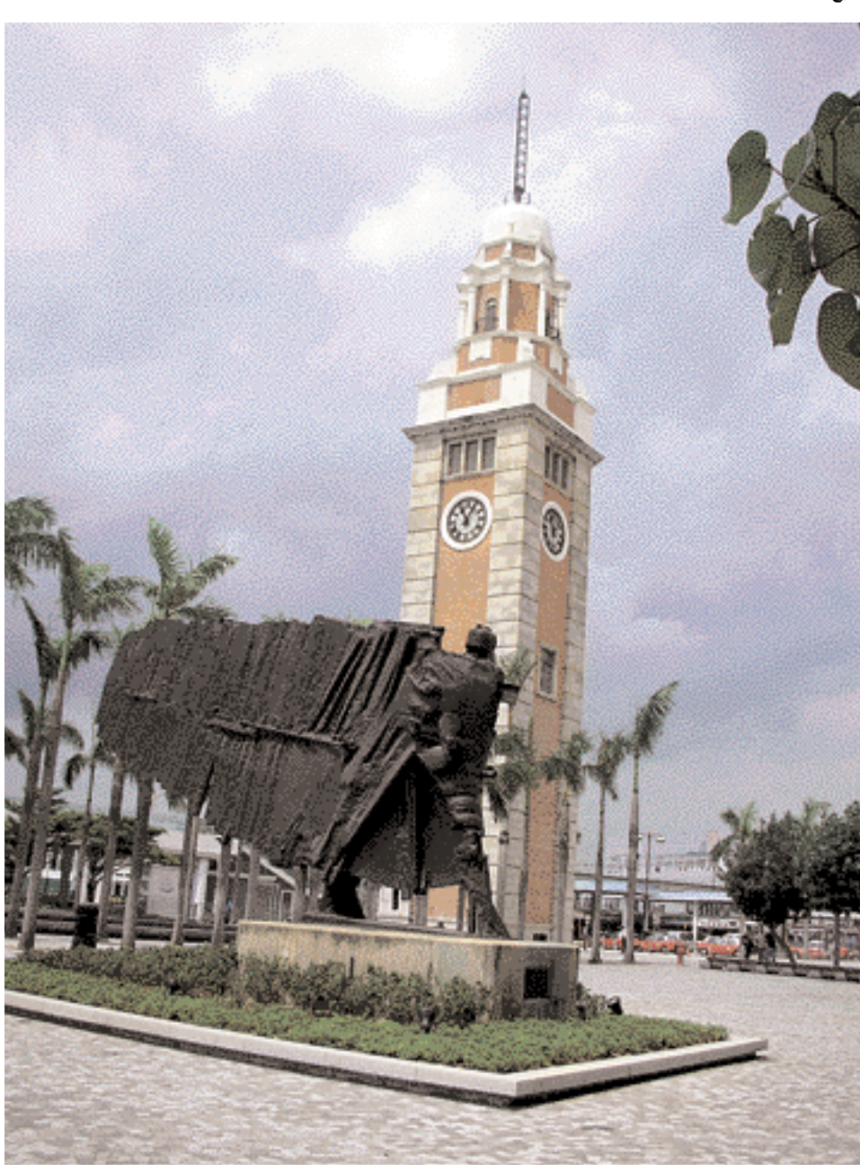
Colonial and Postmodern Hong Kong