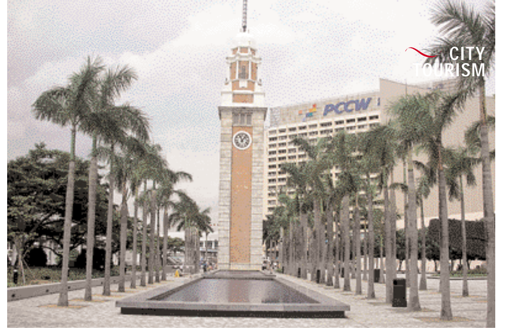
The Clock Tower

The image of today's Hong Kong is dominated by global businesses, sky scrapers, advanced communications and information technologies, luxurious shopping malls, fascinating night life, international restaurants and modern lifestyles. Indeed, the city is able to satisfy the demands of every tourist. Beyond the above-mentioned state of the art services, Hong Kong offers beautiful beaches, nonmotorized islands, virgin green landscapes and rural experiences. The family-oriented entertainment and cultural infrastructures have been developing rapidly in the last years. In addition to theater and concert halls, the Cultural Center in Kowloon which opened in 1989 hosts the new Museum of Modern Arts. The newlylaunched first-in-Asia Disney Land aims to attract new tourist segments. >