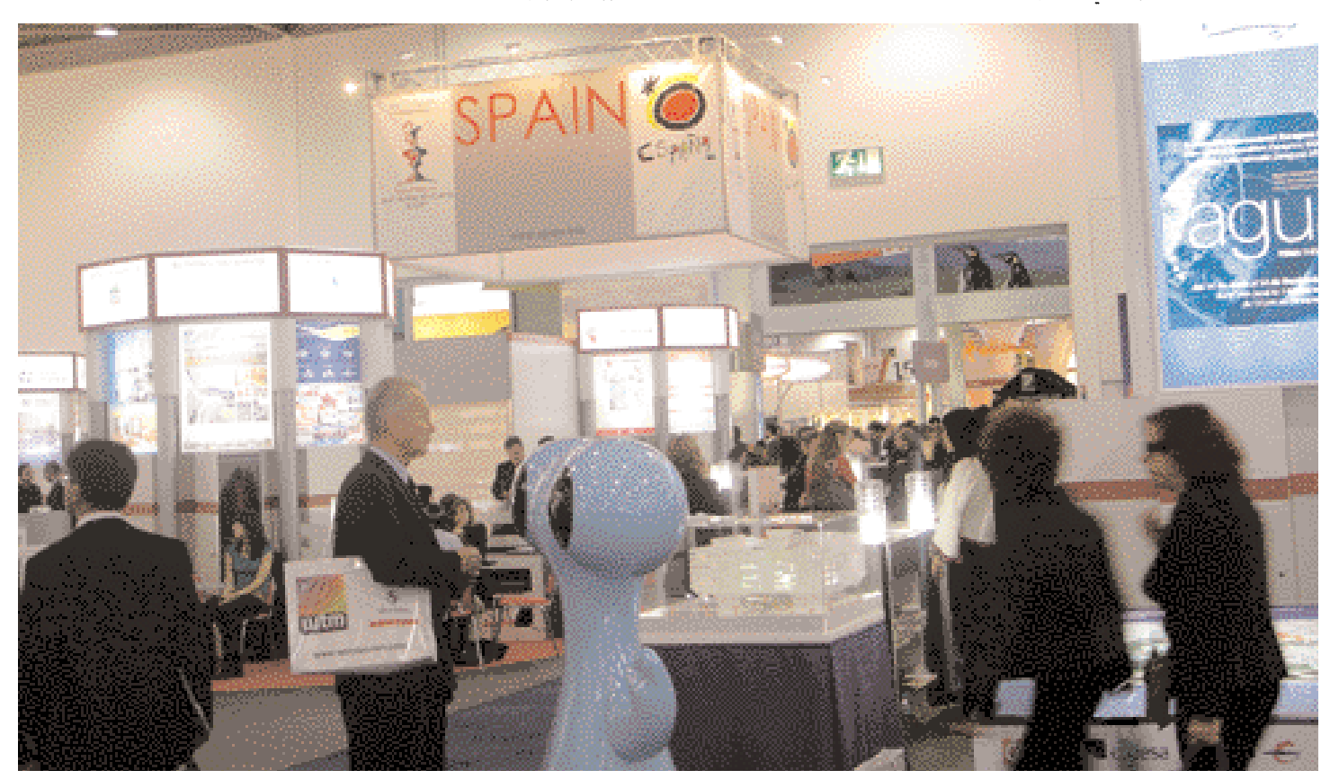
منظر عام منظر عام