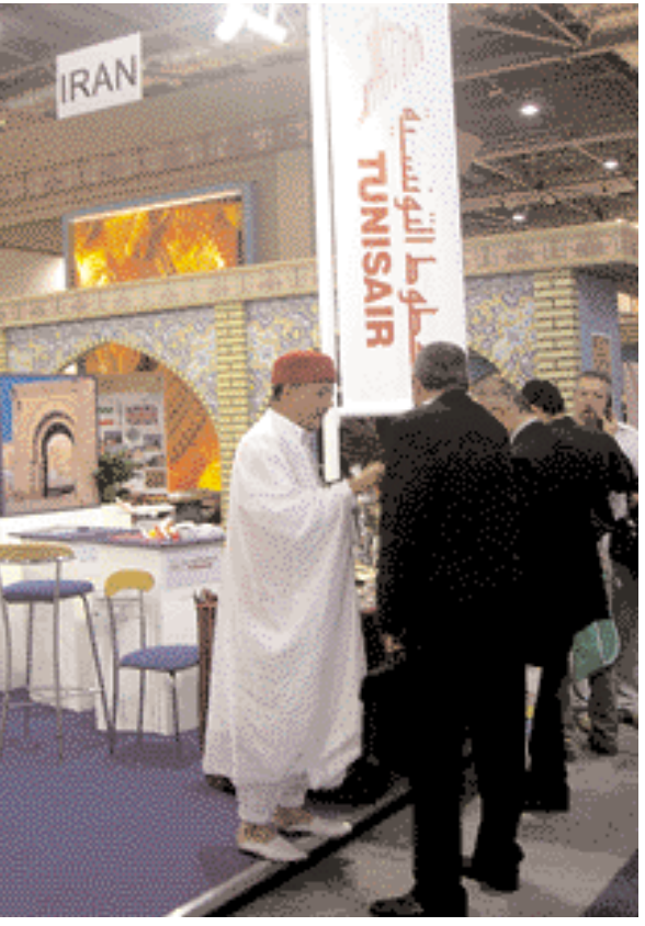
Inside the exhibition