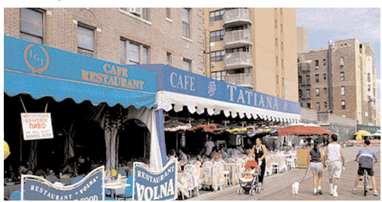
The boardwalk at Brighton Beach, known as «Little Odessa»