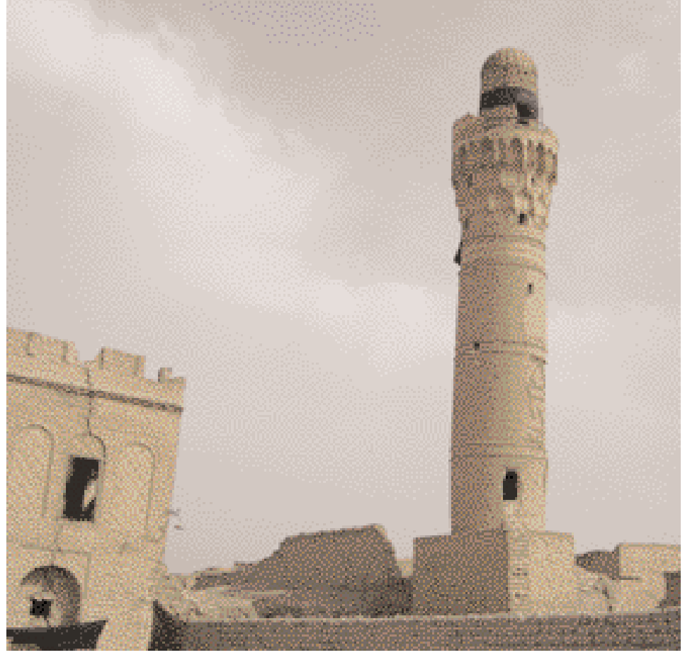
The minaret of Al Nekheila mosque

The Khider site is in a separate room but we found such sites all over the country. Above this site is a high dome, with beautiful inscriptions, but the thick covering of dust makes it difficult to distinguish the colours.