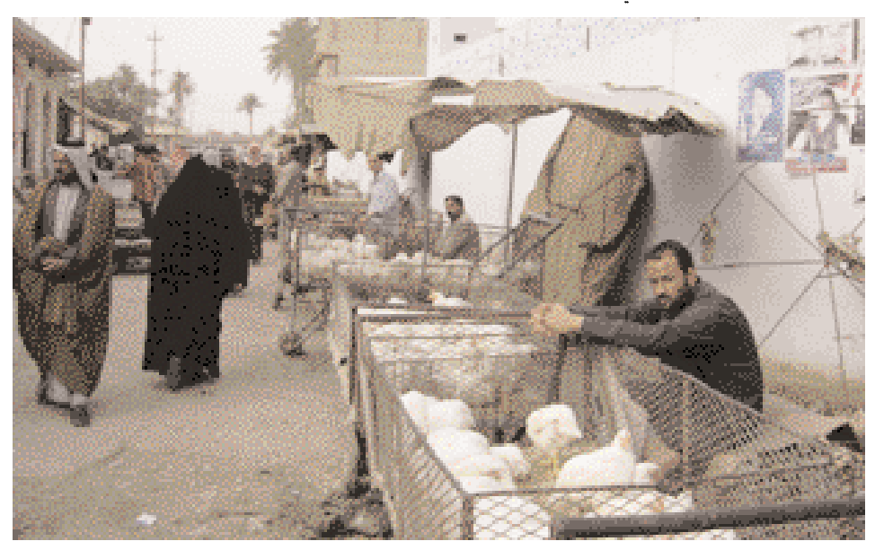
The town's market