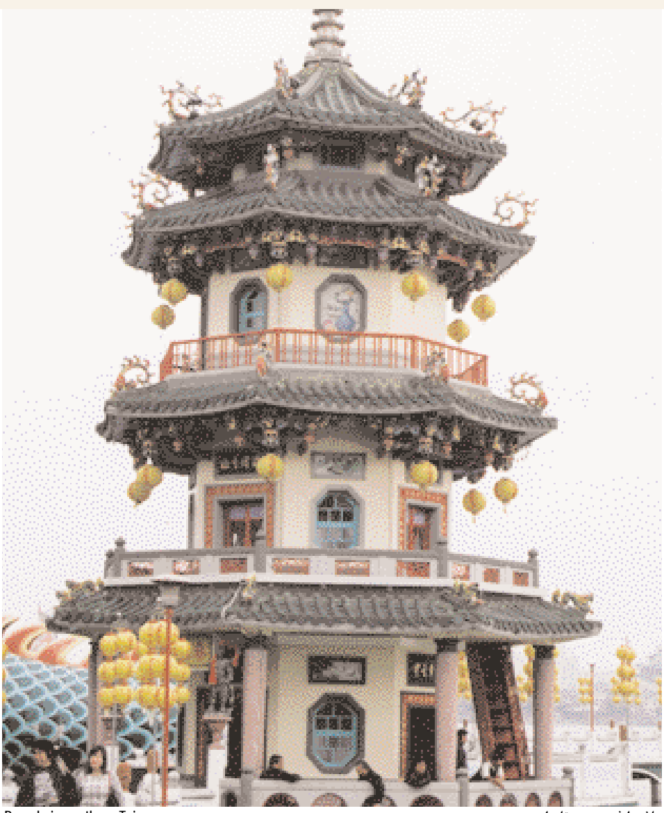
Pagoda in southern Taiwan

But I had returned for two things the lady didn't mention, the annual Lantern Festival, second only to Chinese New Year's as a celebration, and another visit to the National Palace Museum which contains the finest display of Chinese arts and culture