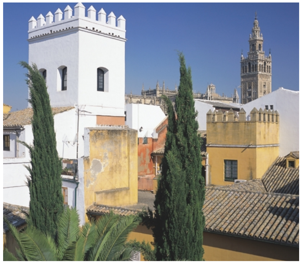
Barrio de St. Cruz

A few days after Holy Week comes the six-day April Fair held in a vast canvas town. Hundreds of kiosks and pavilions, decorated with flags, flowers and lanterns, at night brightly illuminated, give the tent-fairground a seductive air. Amid this colour are held picturesque parades featuring magnificent stallions mounted by couples dressed in traditional Andalusian finery. During the festivities, the foremost bullfights, highlighted by the top matadors of the season, are held. Year after year, masses of people come from all parts of Spain and beyond to join in the revelry. Hence, it is very important for visitors to make hotel reservations long before the events take place. The excitement, drama and delights of Seville, especially during its fairs and festivals, have inspired a good number of novels and plays. The most popular drama in Spanish literature Don Juan Tenorio's novel and opera 'Carmen', and the 'Barber of Seville' - all have some connection to that city. They have given it a world-wide reputation as a place of dark haired beauties, flowers, splendid processions, light-hearted gaiety and the halo of enchanted patios - all not figments of their authors' imaginations, but attributes of everyday Seville, much of which comes by way of the Moors.