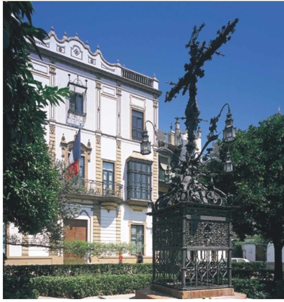
الباريو دی سانت کروز

The oldest and richest of the cities in Andalusia with an aristocratic history, Seville is a coquettish-cosmopolitan urban centre of some 1,300,000 - Spain's fourth largest city and the capital of Andalusia. Before and during Roman times it was an important urban centre, but it reached its age of splendour under the Moors. They called it 'Ishbiliya' (an Arabized form of Seville) and it became a dazzling metropolis and the home of kings, musicians, poets and men of letters. The Christians recaptured the city in 1248, and it subsequently lost its importance for some centuries. However, after the discovery of the Americas, Seville again became > Barrio de St. Cruz