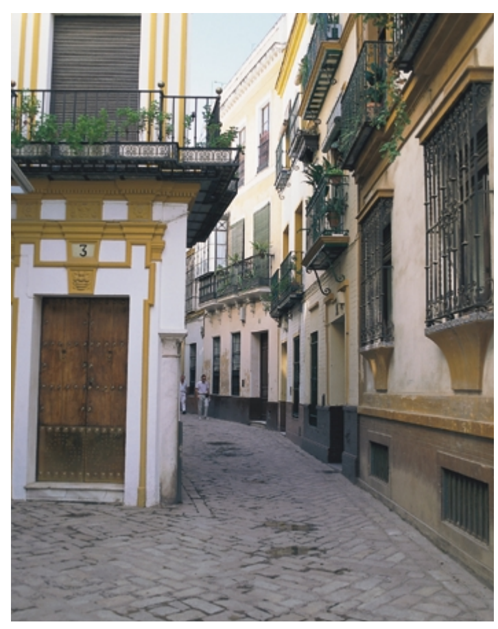
Barrio de St. Cruz

Palace, the quarter is a labyrinth of exotic and clean tiny streets, edged by Moorish >