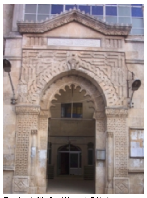
The minaret of the Grand Mosque in Takharim مدخل جامع كفر تخاريم