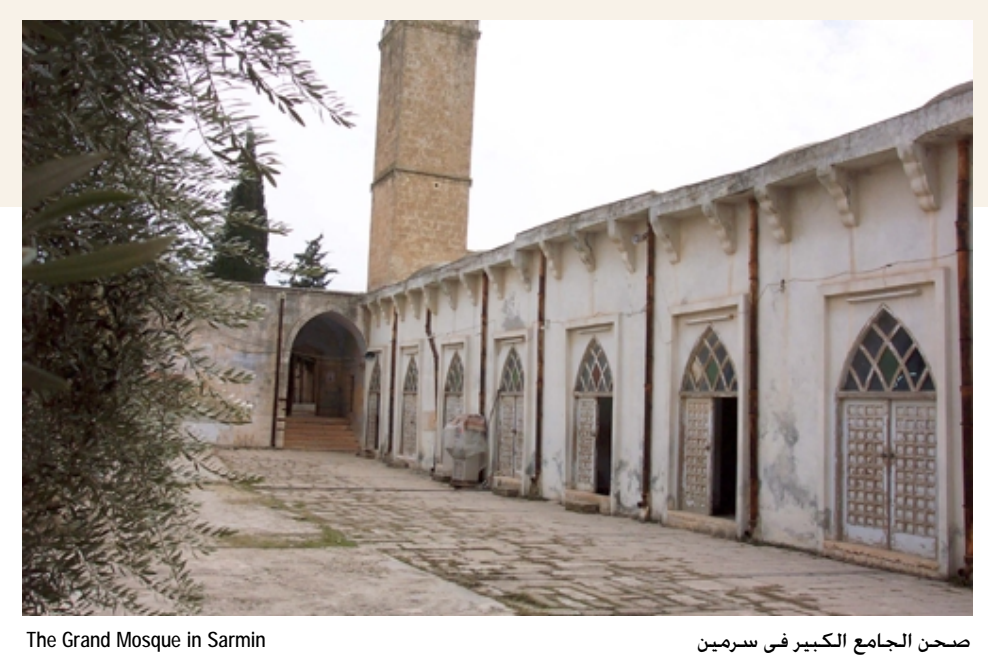
The Grand Mosque in Sarmin

"Idleb is a piece of heaven and a fruitful forest". This is how a French traveller described the Syrian province in the north-west of the country, bordered to the north by Turkey, Hama from the south, Aleppo from the east and Latika from the west.