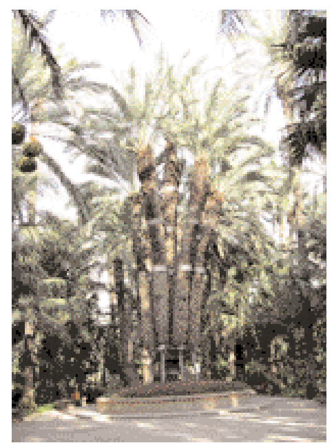
The Imperial Palm Tree