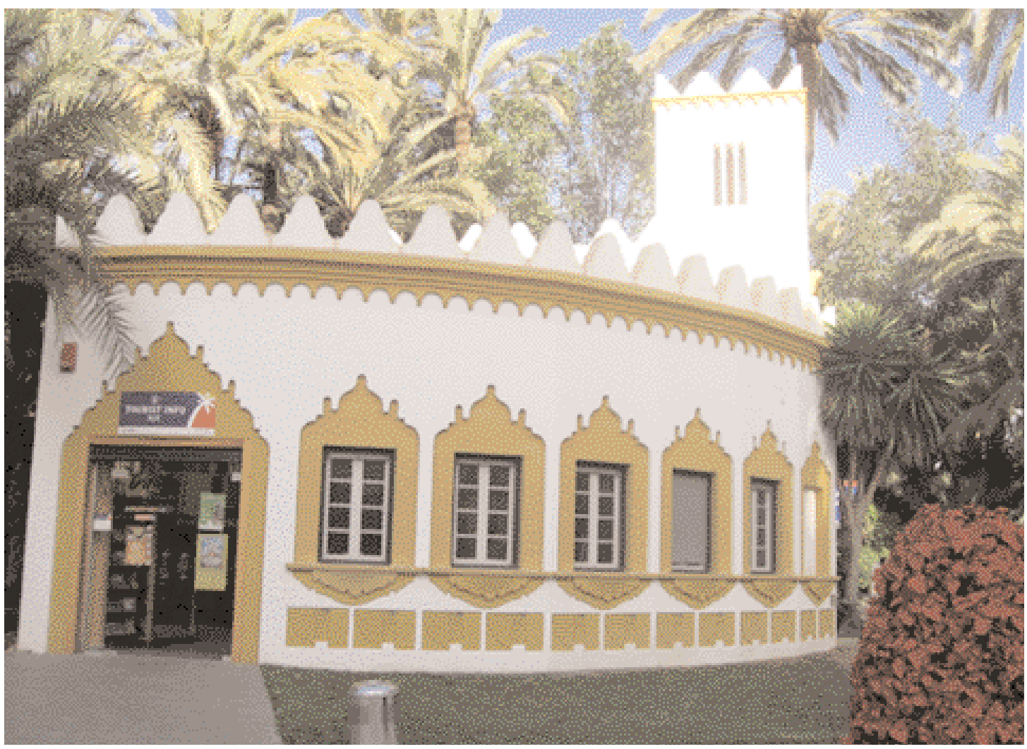
The Tourist Information Centre