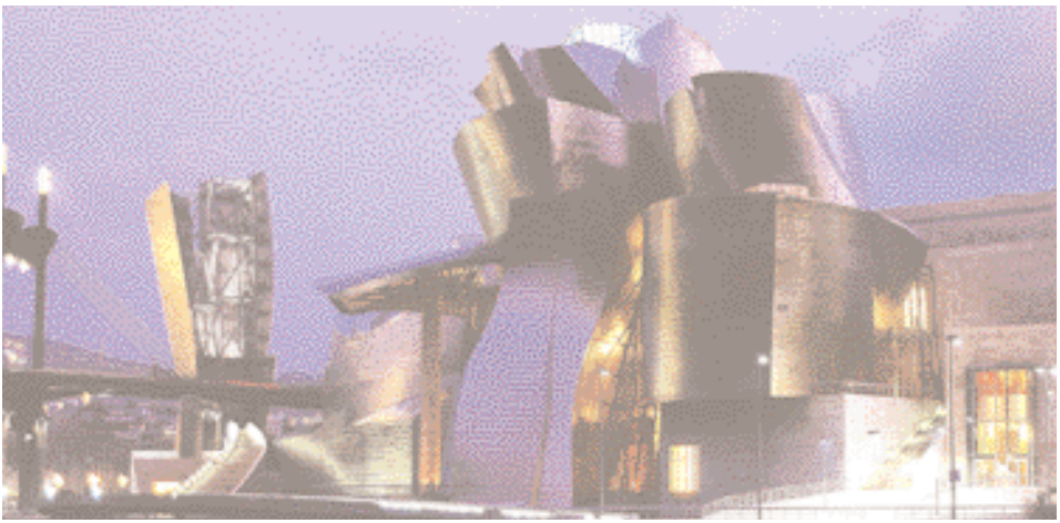
متحف غوغنهايم للفنون Guggenheim

Cool mornings, hot afternoons and a 30 percent chance of rain are common in northern Spain, so pack accordingly. Dress is informal just about everywhere.