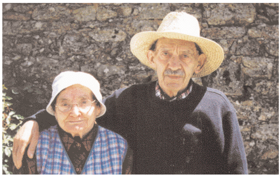
Mom & Pop

While the "Road to Santiago" has no true beginning, there are many routes throughout