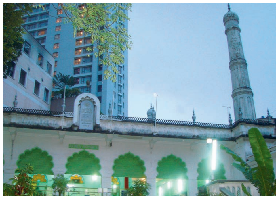
The Sheraton behind the mosque

Seventy percent of Vietnamese are Buddhists,