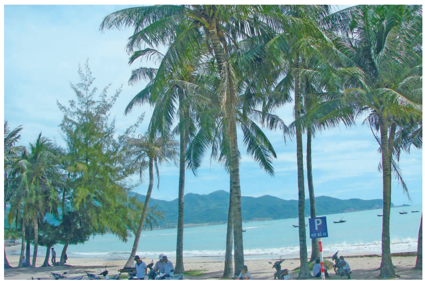
Nha Trang Bay خليج نها ترانغ