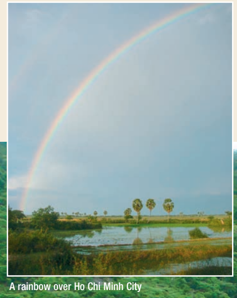
قوس فزح فوق الطريق إلى هوشي منه ستر

If the terms "people's tourism" or "will tourism" were valid, Vietnam would be the champion. Believe me I went there to see people first, before seeing the monuments; to taste the flavour of will before tasting delicious Vietnamese dishes. The Vietnamese people wanted life and destiny has responded favourably without hesitation. Since 1945, this nation has faced death to liberate its country from French colonisation, then American, and God gave it life in 1975. The period between these two dates was dominated by fighting and strife, will, bravery and legendary sacrifices. It was followed by an extraordinary effort for development and progress. All this made the Vietnamese people face the world with a sweet smile on their faces, and overflowing happiness. Anyone arriving in Vietnam will feel safe and secure in this beautiful country which is really a harmonious symphony for tourism.