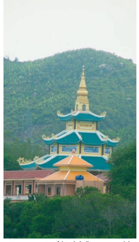
A temple in the green mountains معبد وسط الجبال الخضراء