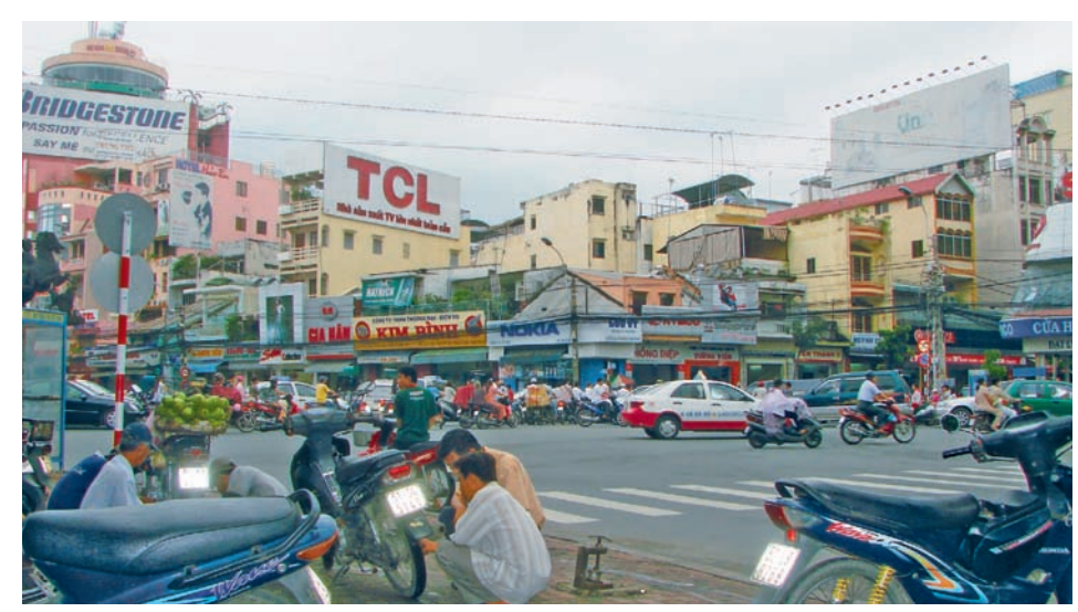
Ho Chi Minh City

We also visited the island of Nha Phu, with Evason Hideaway, one of the most expensive hotels in Vietnam, where the price of a room ranges between $600 to $2000 a night. Orchid resort, on another island, is famous for its rich flora and fauna: hundreds of varieties of trees, plants and flowers, as well as elephants and ostriches (which you can ride), and bears. There are also lakes full of goldfish. My trip to Vietnam, despite its short duration, was really one of the unforgettable trips of my life, during which I was able to appreciate everything that can be described as beautiful and amazing. It is not easy for tourists to rank the most beautiful attractions in the country. Is it the magnificent natural landscapes, attractive beaches, or beautiful cities? Is it its cuisine, its moderate prices, or the pleasure of shopping? The appropriate response to these questions should perhaps be the valiant people of Vietnam who were quick to overcome the consequences of war. Through their hard work and tenacity, they have built a country which can best be described as a harmonious tourist symphony known as "Vietnam". ■