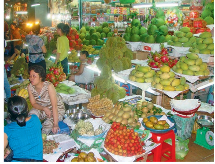
سوق تشو Fruit market in Saigon