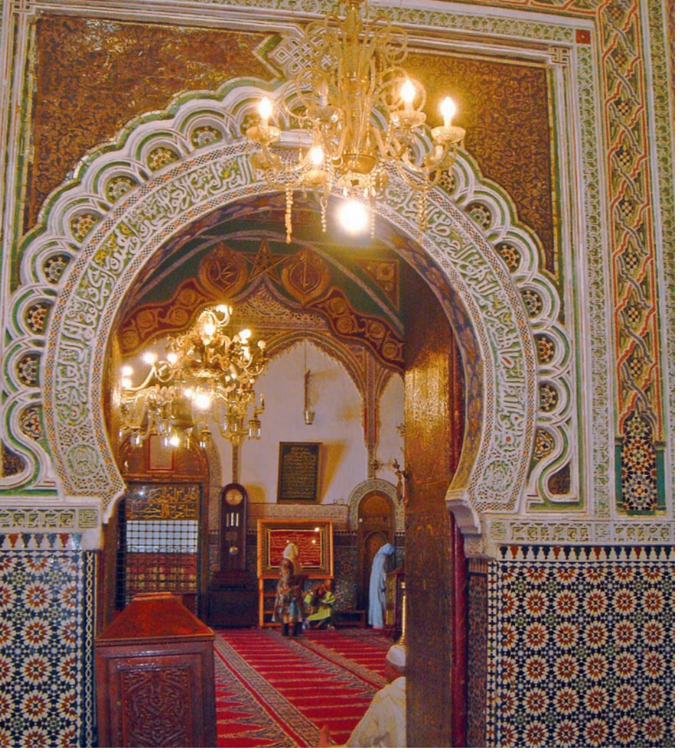
The mausoleum of Idriss II

Through the celebration of 1200 years of the founding of the city of Fez, Morocco aims to remember a story that was a model of coexistence and harmony of communities with different cultures and religions living in peace and cooperation.