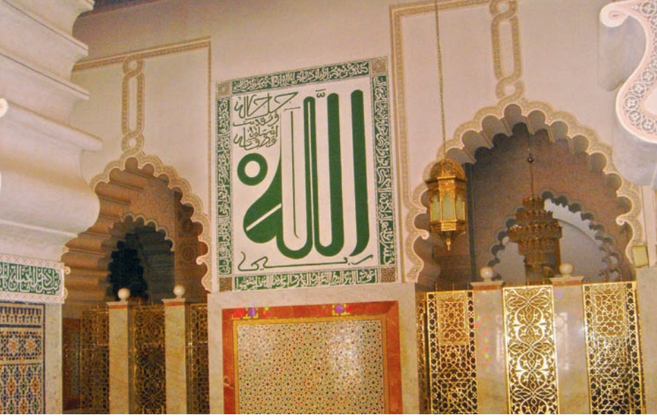
The mausoleum of Ahmed Attijani