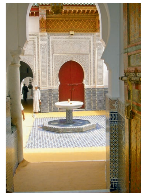
The mausoleum of Idriss I