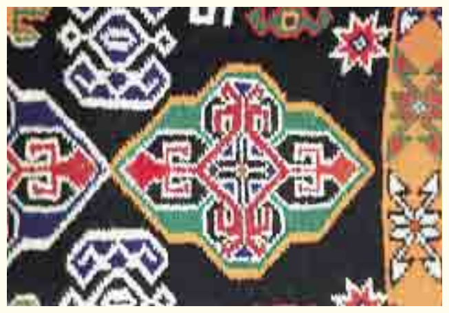
الأنسجة الصوفية حرفة تشتهر بها مدينة الوادي Woollen Crafts of Al-Wadi