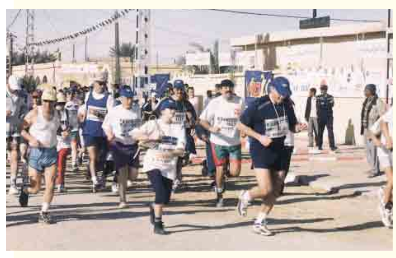
سباق الماراثون السنوي في مدينة الوادي Annual Marathon