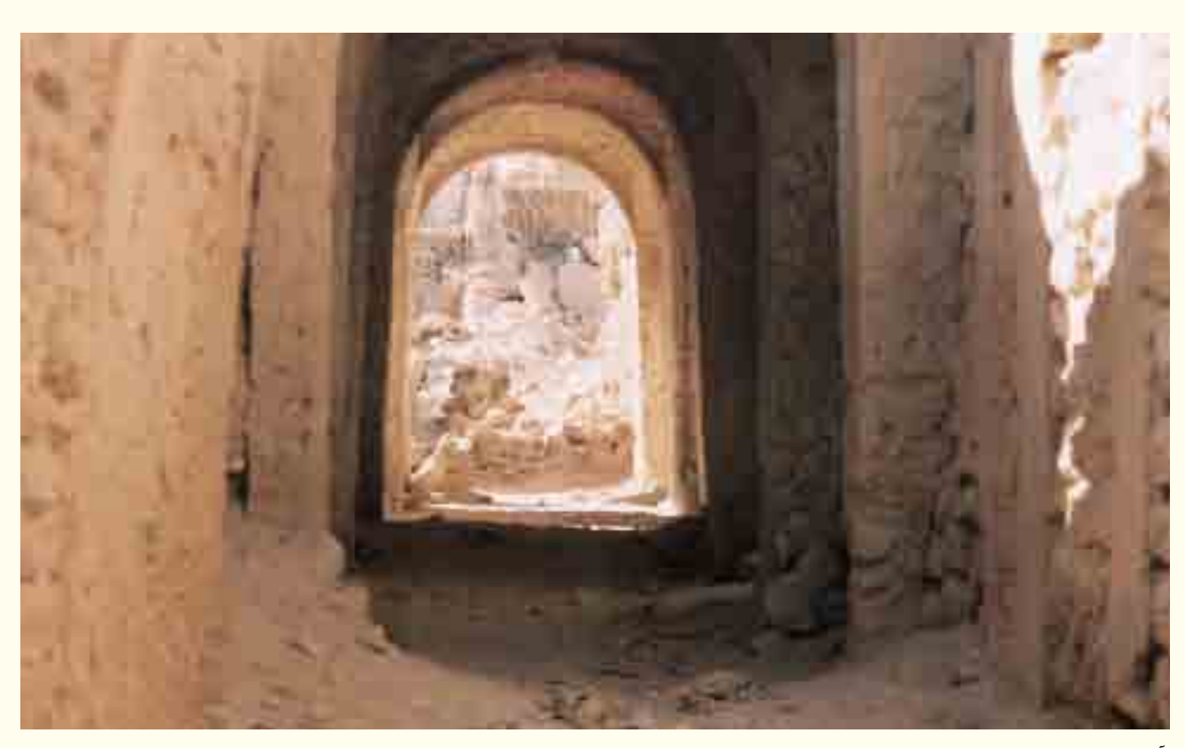
آثار قصر تمرنة بجامعة – مدينة الوادي Remains of Tamurnah Bijamia in Al-Wadi

every available convenience for modern living. This is perhaps the secret of its beauty, particularly with regard to the Old City, whose history, civilization, architecture and people will leave you with a sense of the past and the present.