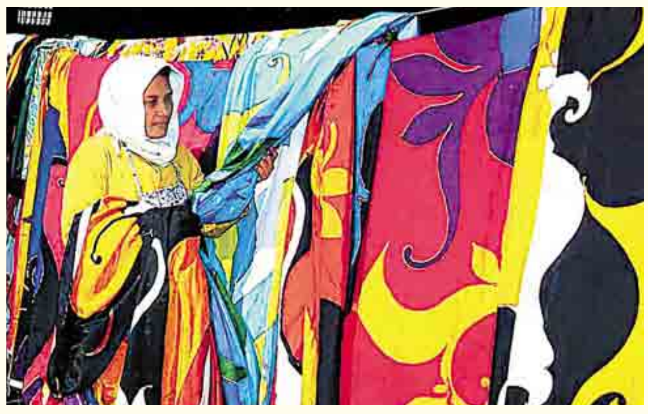
النقش على القماش – ماليزيا Handmade Patterned Cloth

speed the cultural and tourism-related wheels of such economies.