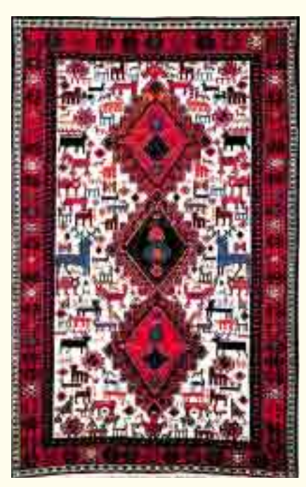
سجادة ذات نقوش رائعة Rug with intricate Ornamentation

IRCICA aims to focus on specific areas in which crafts face certain obstacles and difficulties preventing their development. Such obstacles are due mainly to the increasing use of machinery, the widespread mass production of machine-made products, the hard living conditions which push the artisan to leave his / her traditional occupation to work in factories, a lack of funding, insufficient education and training opportunities, difficulties encountered in marketing, and other exigencies. The sector acquires even greater significance when one considers its potential to bring in satisfactory investment returns and other economic benefits. It offers job opportunities to a considerable percentage of manpower without requiring large capital investments; it encourages tourism, increases the national income and the inflow of foreign currency; it provides opportunities for establishing crafts villages that can generate greater economic activity on the part of the unemployed portion of a particular labour force,