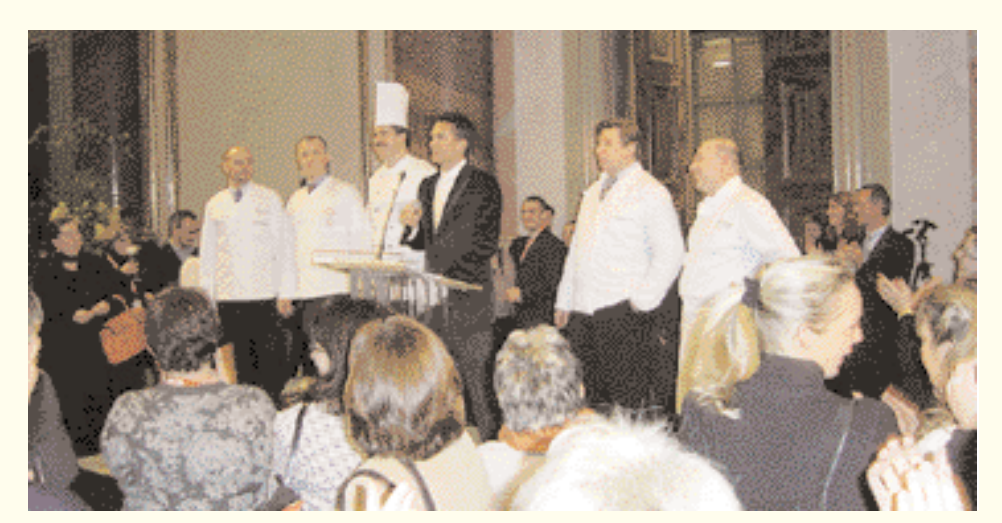
Honouring the cooks