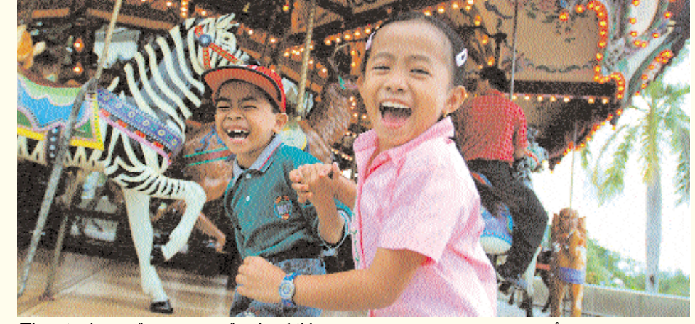
There is plenty of amusement for the children.