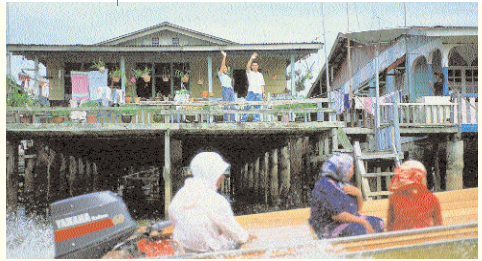
Houses built on shallow water.

Bandar is located in the Brunei - Muara district, the smallest but most populated of Brunei's four districts. Outside Bandar, in the Tutong and Belait districts, but never too far due to the country's small size, a number of