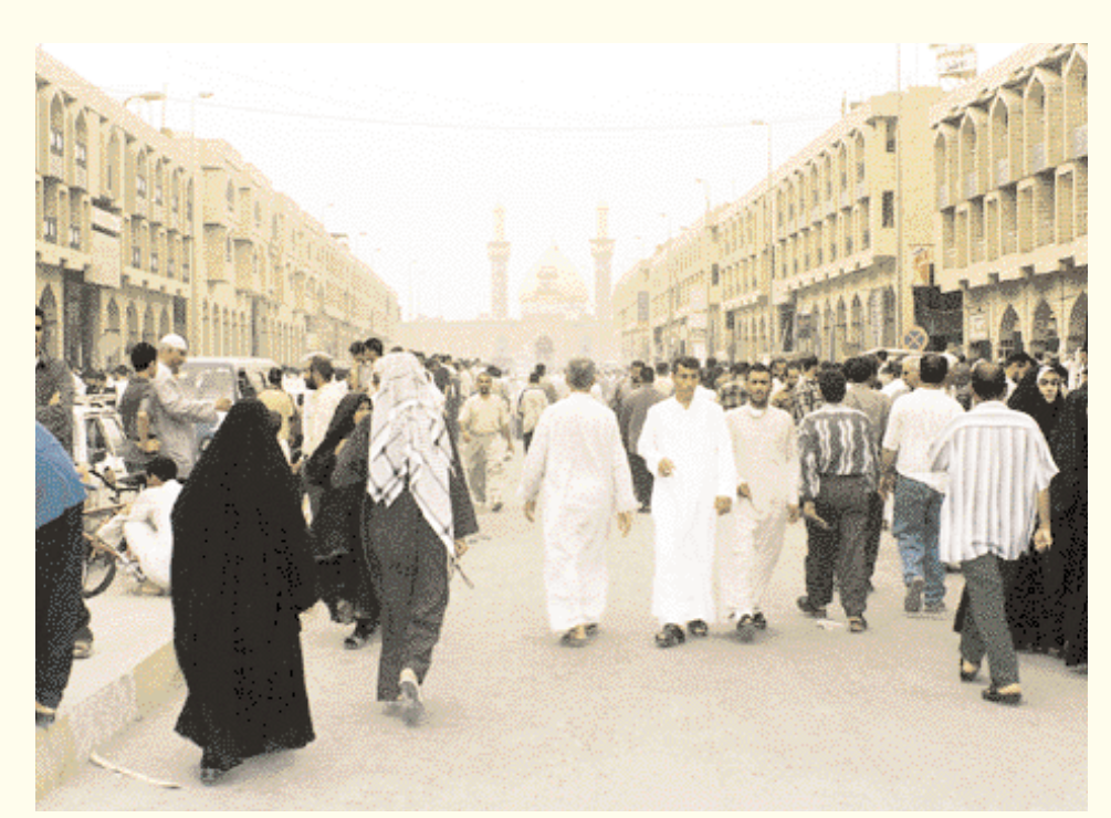
Kerbala is full with visitors all the year round.

These shrines and holy sites were revered by sultans, emirs and presidents who have