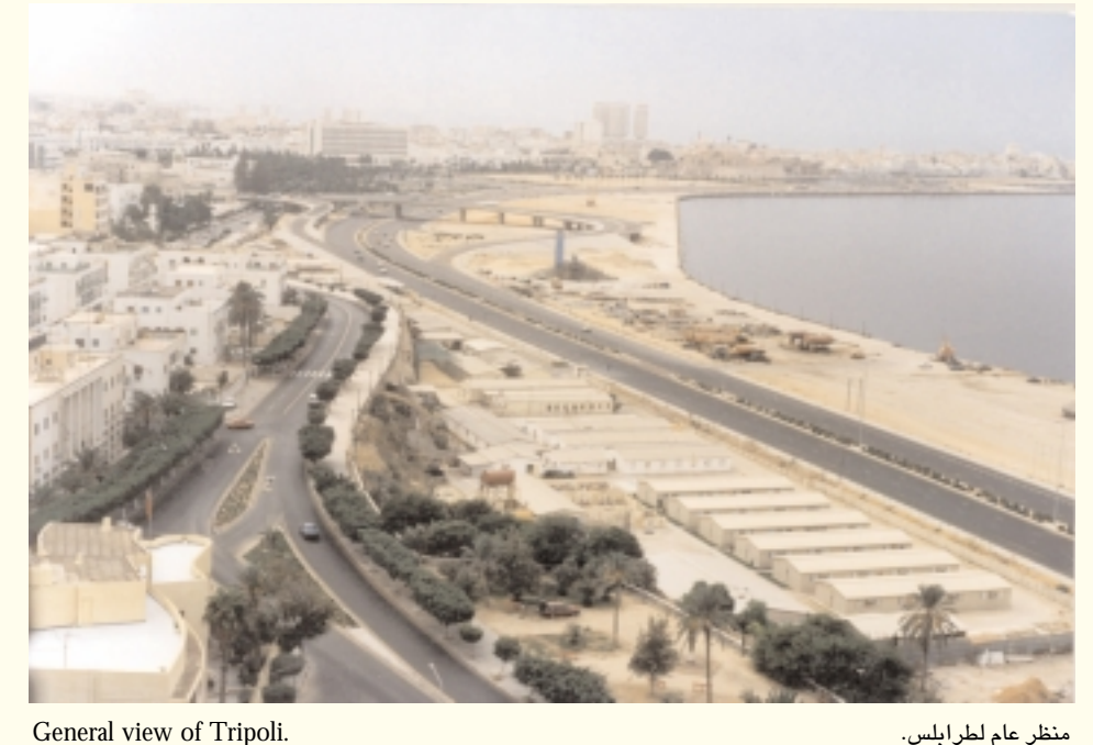
General view of Tripoli.

He added that a dialogue has started with four or five European companies to build and run hotels and resorts. The plan also includes the participation of Libya in world tourism and travel markets, taking part in festivals abroad and establishing a dialogue with businessmen who will be invited to invest in the country. The law of investment guarantees exemption from taxation for up to eight years. Libya now receives about half a million visitors every year. The new plan aims at increasing the number to ten million in ten years time and providing investors with a good opportunity to invest in the tourism services sector.