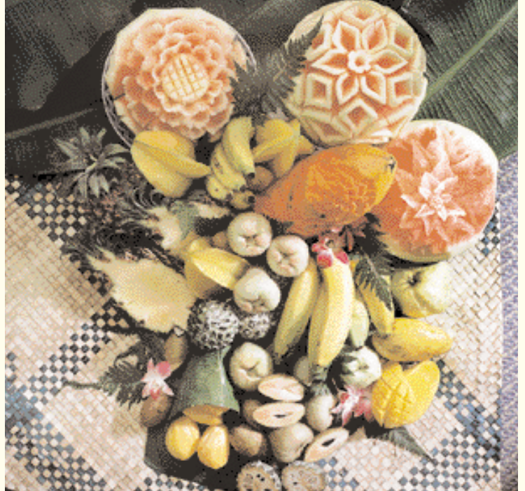
An attractive display of fruit in the local market.

As a result, the "Keltanese" way of life has not been watered down through foreign and colonial influences, and Malay culture has been preserved in all its traditional richness