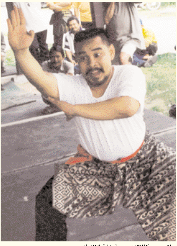
راقص من كلانتان وهو في غاية الإنفعال. • Kelantan dancer working himself into a trance-like state.