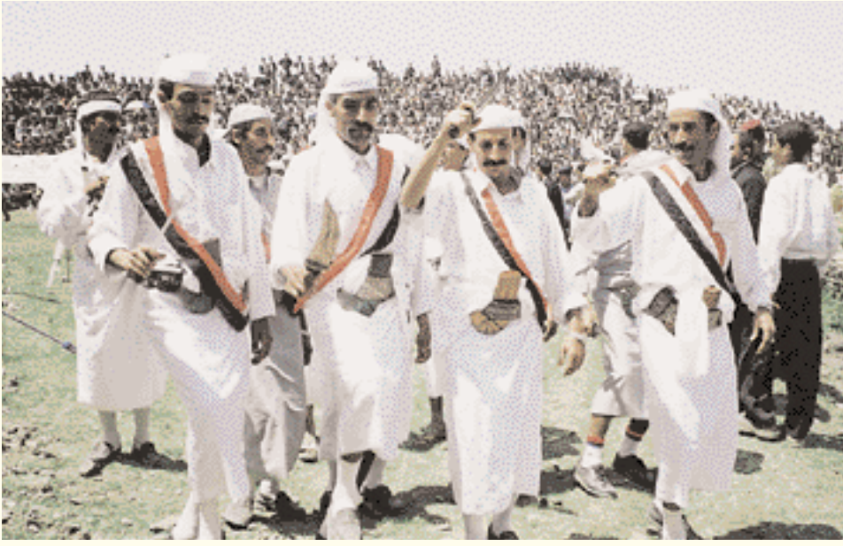
Folkloric dance in Ibb Festival.