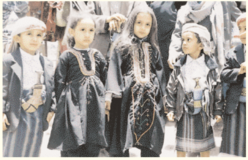
Folkloric costume in Ibb Festival.