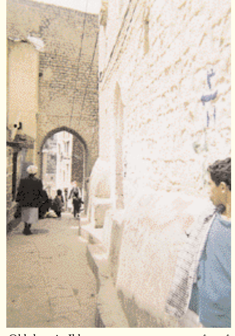
Old door in Ibb.

Ibb still has its authentic traditions and