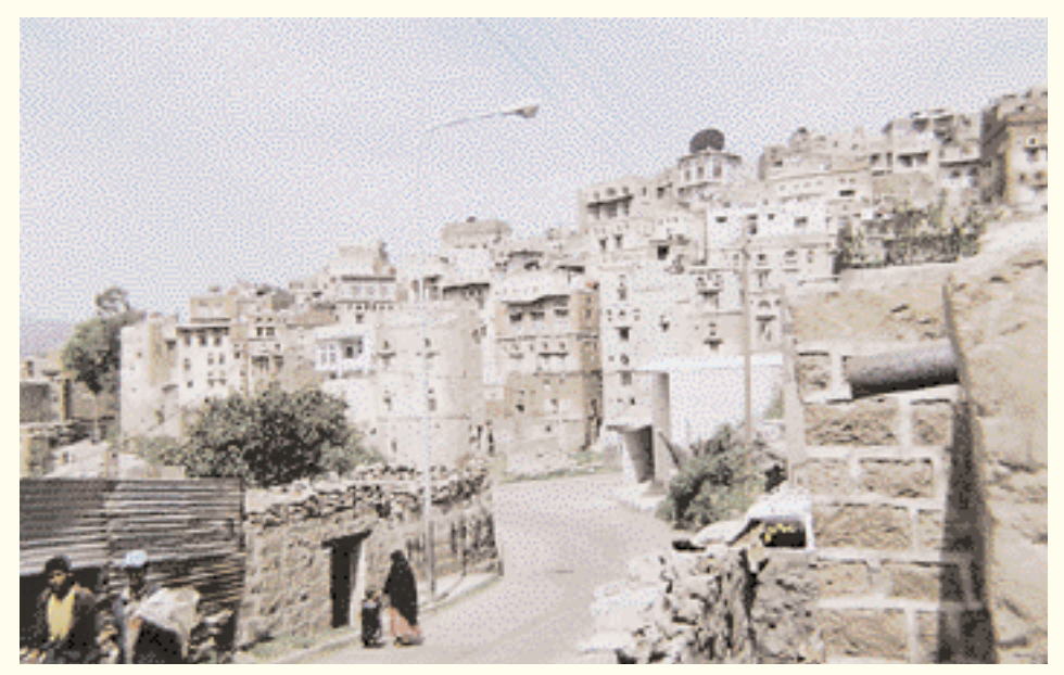
The Eastern entrance of Ibb.

The tourists who attended were delighted by the natural beauty and cultural heritage of the region. A number of investors also expressed a willingness to invest in the tourism sector. The festival was well covered by satellite television and Islamic Tourism magazine was awarded a certificate for its participation by the governer of lbb and its counsel.