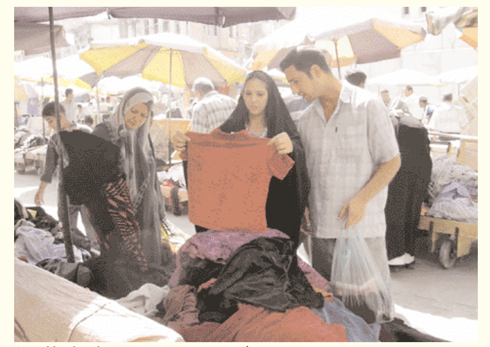
Second hand market.

بائع حلويات على قارعة الطريق أمام ساحة الرصافي وسط العاص