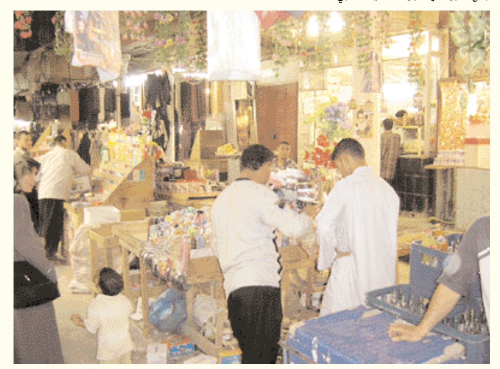
Clothes market in Kadhimiah.

The game depends on observation, nerves and the ability to keep facial expressions under control. Sweets are handed out to all the players and the audience. The atmosphere is one of gaiety, even for the loosing team. The most famous teams come from the districts of Fadhil and Kadhimia. The game has brought people from different backgrounds together and strengthened relations between the various districts of Baghdad.