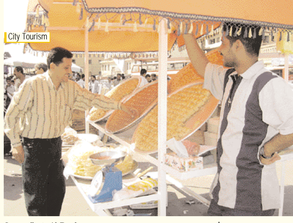
Sweet seller in Al-Rasafi square.

بائع حلويات على قارعة الطريق أمام ساحة الرصافي وسط العاص