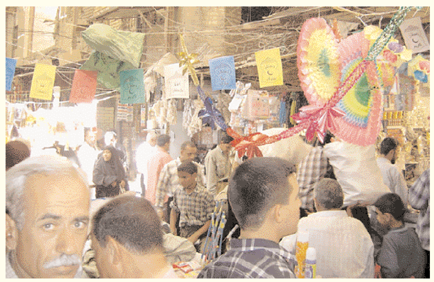
Streets and markets are decorated for the coming of the month.

Baghdad-Walid Abdul-Amir Alwan