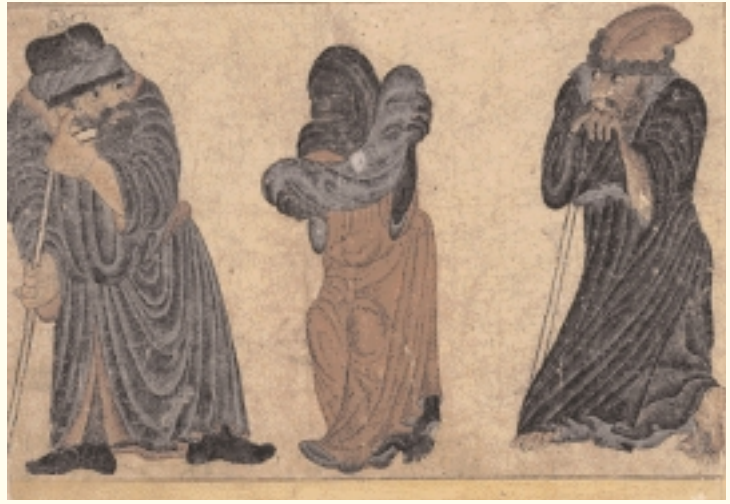
Nomads, fourteenth century, Central Asia