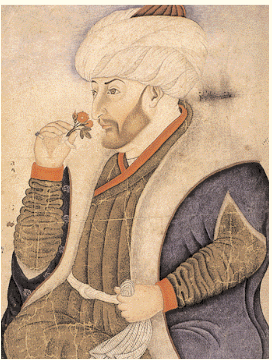
Sultan Mehemed Fatih