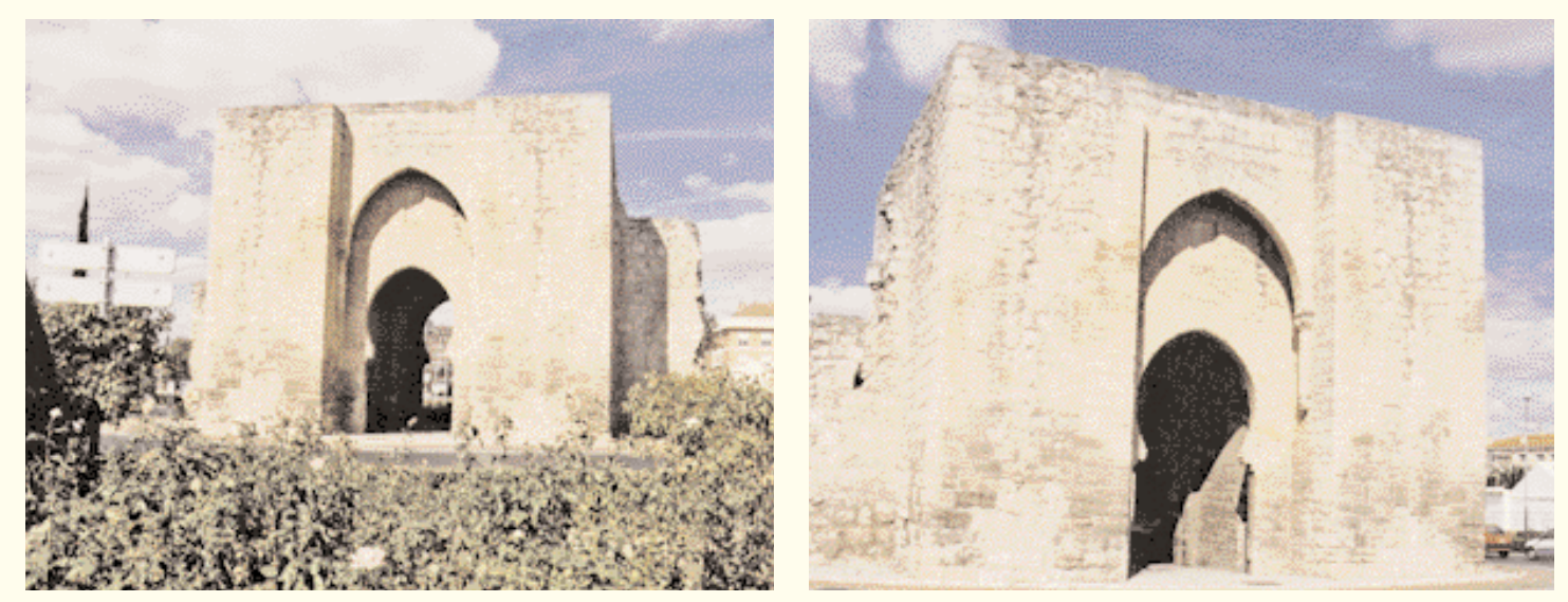
Toledo gate/ Ciudad Real.

was a prisoner in Algeria for about five years and wrote all his works, with the exception of a few weak poems, after these years in captivity. Islamic culture leaves its mark on all his work and is a main theme - some plays mention this influence in their title, for example The Treatments of Algeria, The Bathrooms of Algeria and The Great Sultana, a short novel. There are also Muslim settings, characters, expressions and even words and signs.