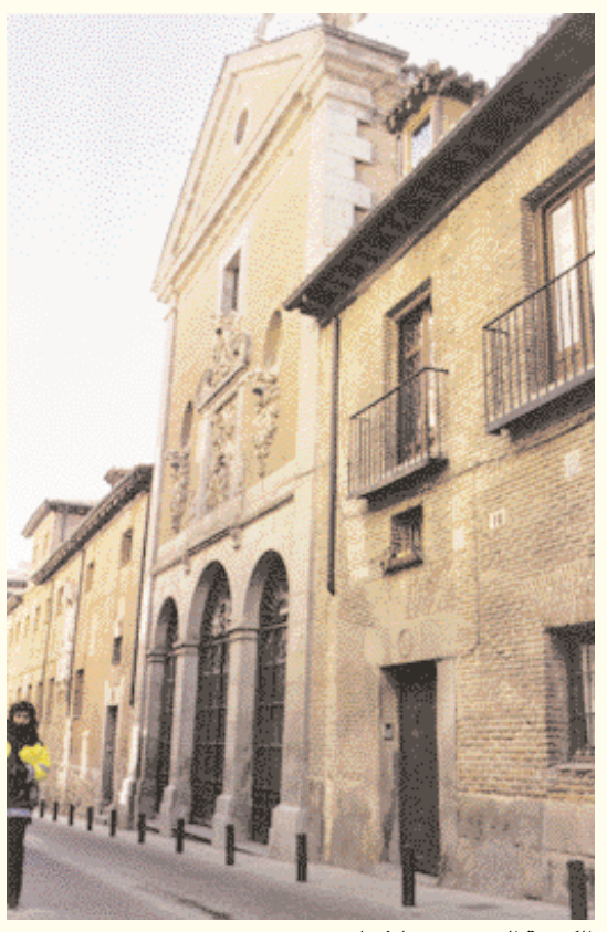
الكنيسة التى دفن فيها ثربانتس

which they named the Castle of Abdul-Salam. It is surrounded by a deep valley and the Henares river. This made it unassailable and difficult to access. The remains of this citadel are in a bad shape and you can hardly find anything of value - it is a heap of