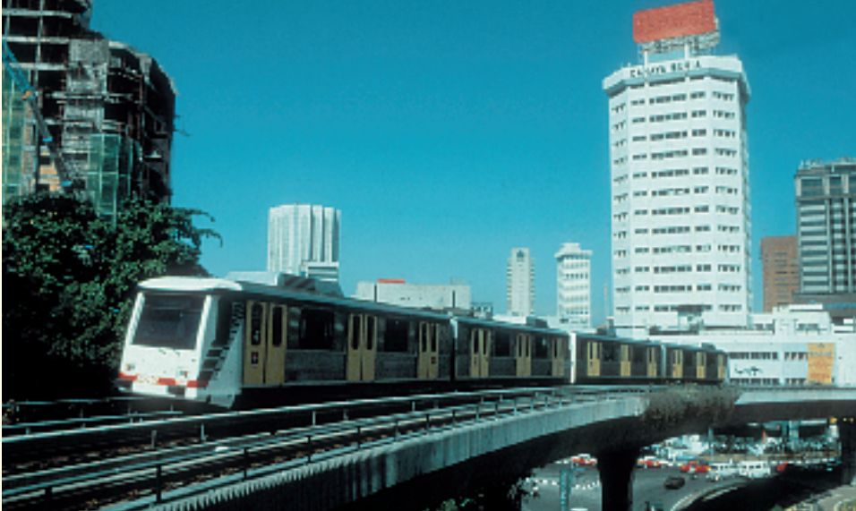
KL Light Rail Transit

Tourism Malaysia can supply useful leaflets. INSIGHT (Malaysia) is a comprehensive guide covering the whole country. The pocket version slipped easily into my camera bag and the full version is good in-depth reading with excellent pictures. Both can be recommended.