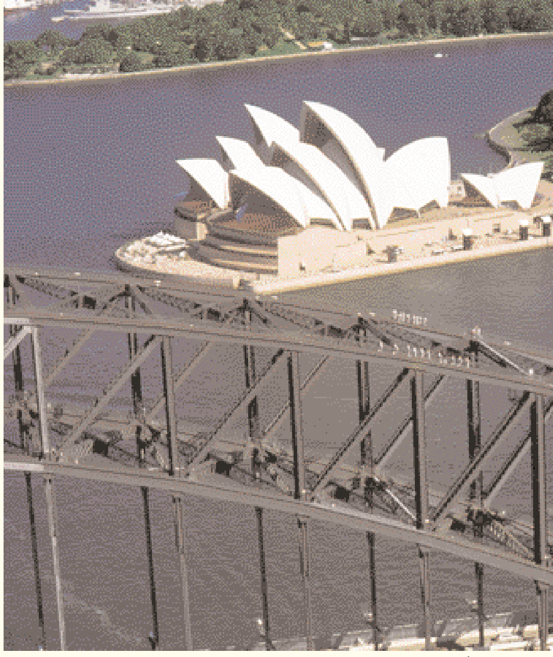
Sydney's famous Opera House

We introduced them to our dishes ful (broad beans), falafal and humus and realized that despite the geographical distance which separates Australia from the other major continents, it's a small world.