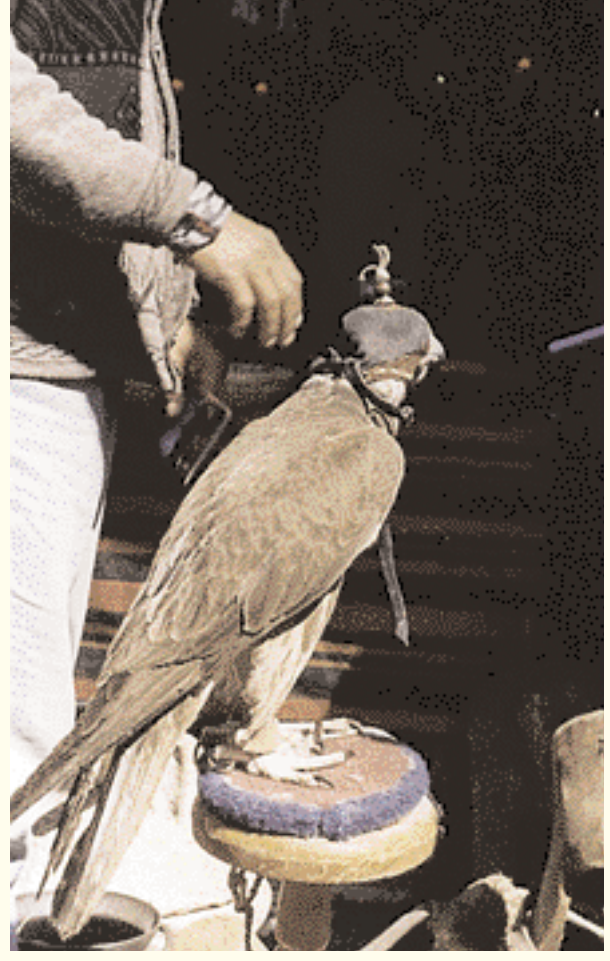
A rare eagle