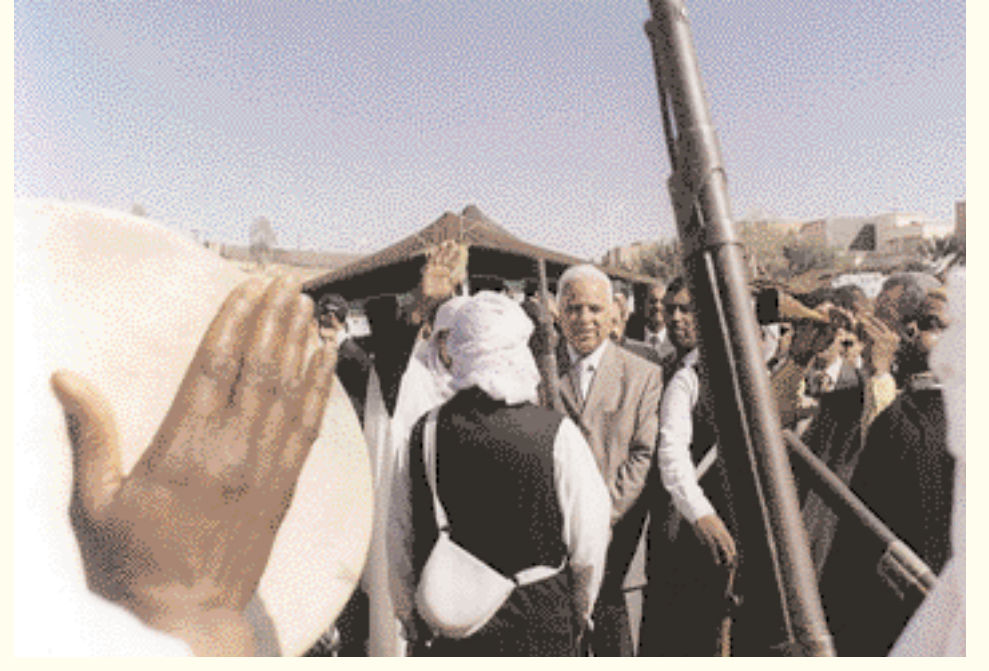
The Minister of Tourism, Mr. Noureddine Mousa opens the Tourism Village