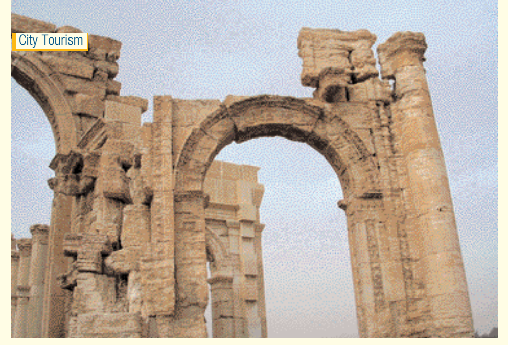
The principal boulevard where caravans and merchants were received