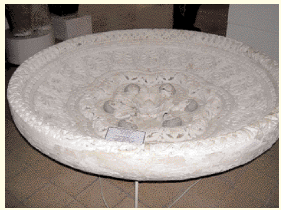
Exhibit inside Jordan's Archaeological Museum